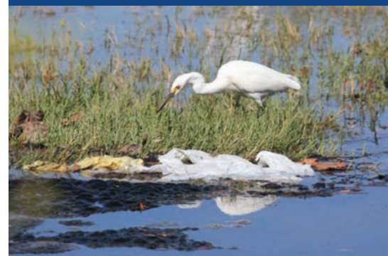
Pictured: An egret picks through plastic trash along the Bay. With your help, we're tackling plastic pollution at the source.

In January, Exxon sued Baykeeper and our partners for defamation. Lawsuits like this are intended to scare nonprofits from telling the truth and to wear them down with expensive litigation. But holding big corporations accountable is in our DNA, so we're not backing down.