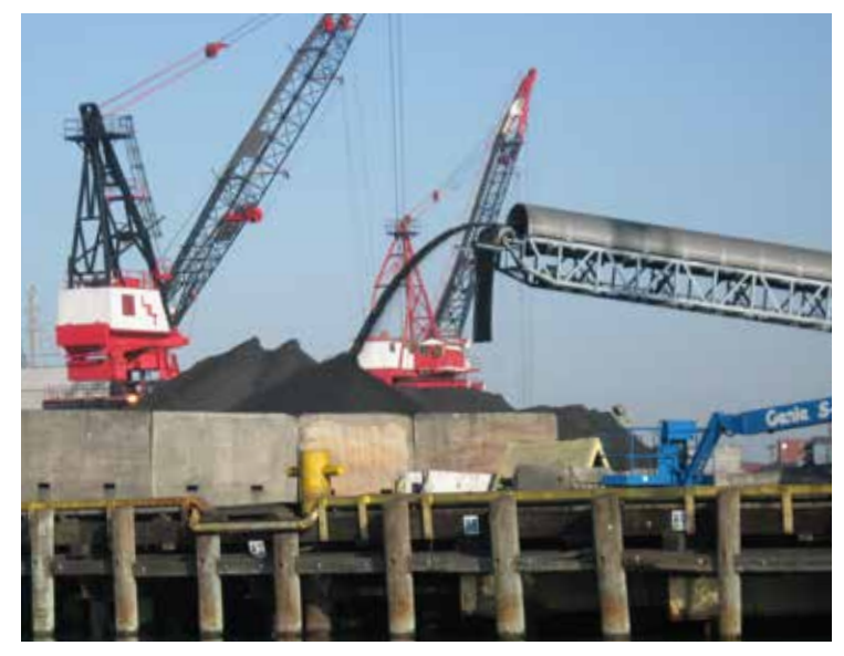
Pictured above, the Levin facility in 2011. During Baykeeper's patrol investigations of the Levin shipping terminal on Richmond's shoreline, staff witnessed wind blowing toxic dust from these piles into the Bay.

We saw wind pick up black dust from the piles, scattering it around the facility and into the water. And as we watched the material being loaded onto a ship, a big black rock landed in the water below.