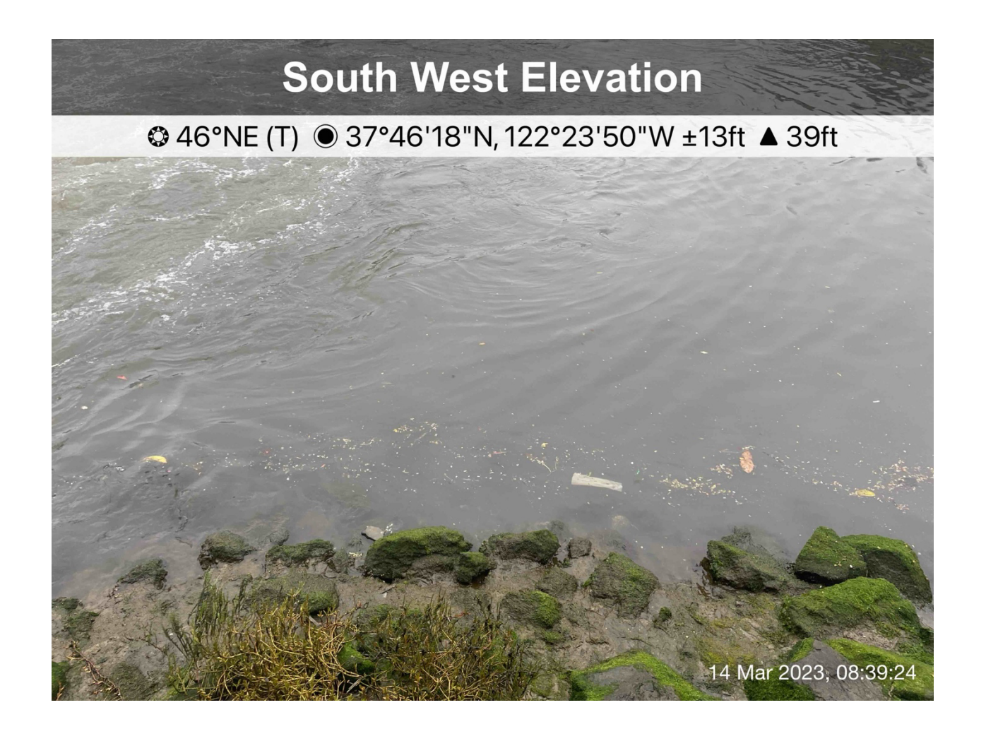
March 2023, floating trash during discharge from 6th and Berry outfall, photo SFPUC.